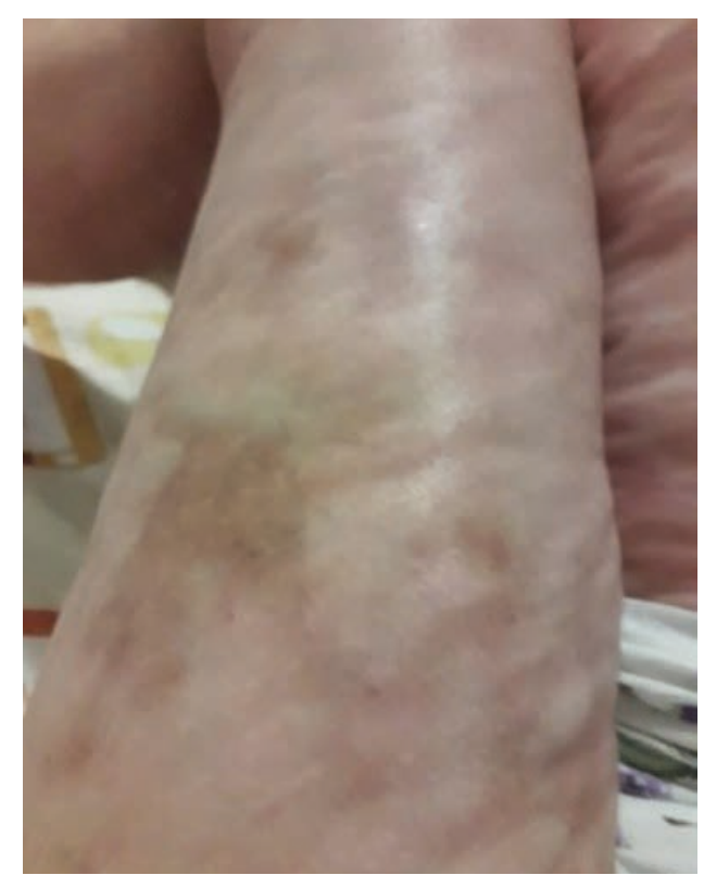
FIGURE 3 and 4. The "groove sign" and the "peau d'orange" texture