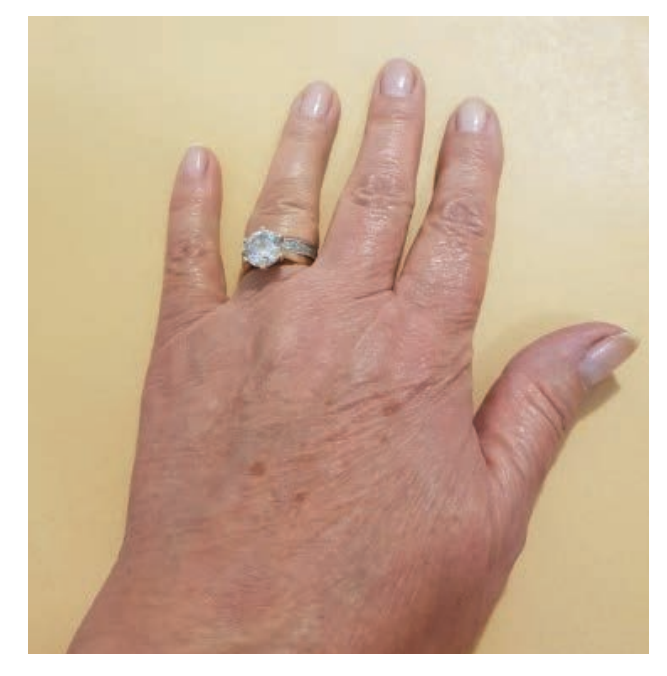
FIGURE 2. Normal skin appearance of the hands, without Raynaud phenomena, no sclerodactyly, no pitting scars, and no digital ulcerations