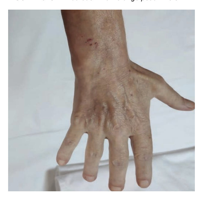
FIGURE 14. Joint contracture