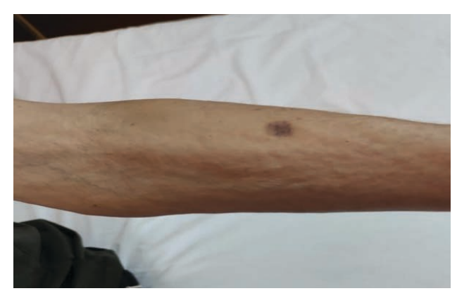
FIGURE 13. Skin induration with "orange peau" like skin