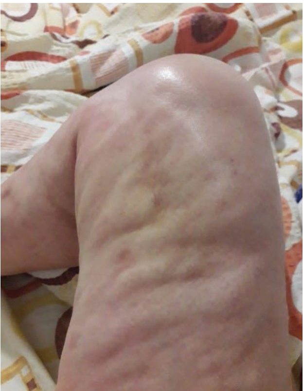
FIGURE 5 and 6. Skin modifications after 3 months of treatment. The appearance of "peau d'orange" diminished, as well as skin erythema and skin "groove sign"