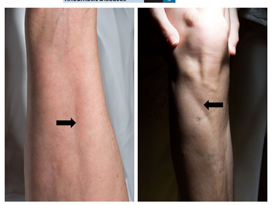
FIGURE 1 Groove sign: Fibrosis of connective tissue around the veins which spares the dermis and epidermis results in superficial layers of skin bowing inward (arrow) which is pronounced when the limb is elevated causing venous pressure to fall